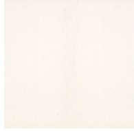
Creamy - 04 (CRY)